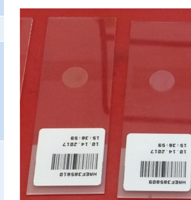
Table 1: Comparison of gram-slides from classical workflow to TLA workflow: a) 212 of 235 (90%) were identical ; b) mismatches (10%); c) gram-slides prepared by the TLA;